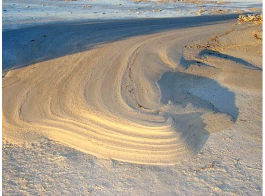
The Salt Flats are a remnant of an ancient, shallow lake that once occupied this area during the Pleistocene Epoch, approximately 1.8 million years ago.

During the Spanish (1848-1821), Mexican (1821-